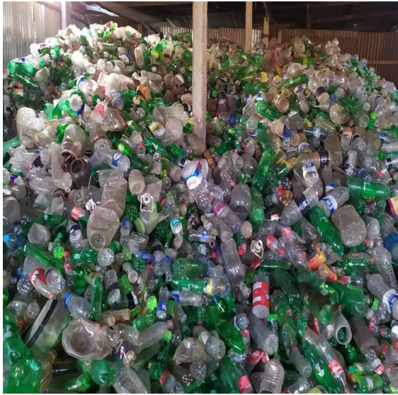
Collection of Plastic Waste