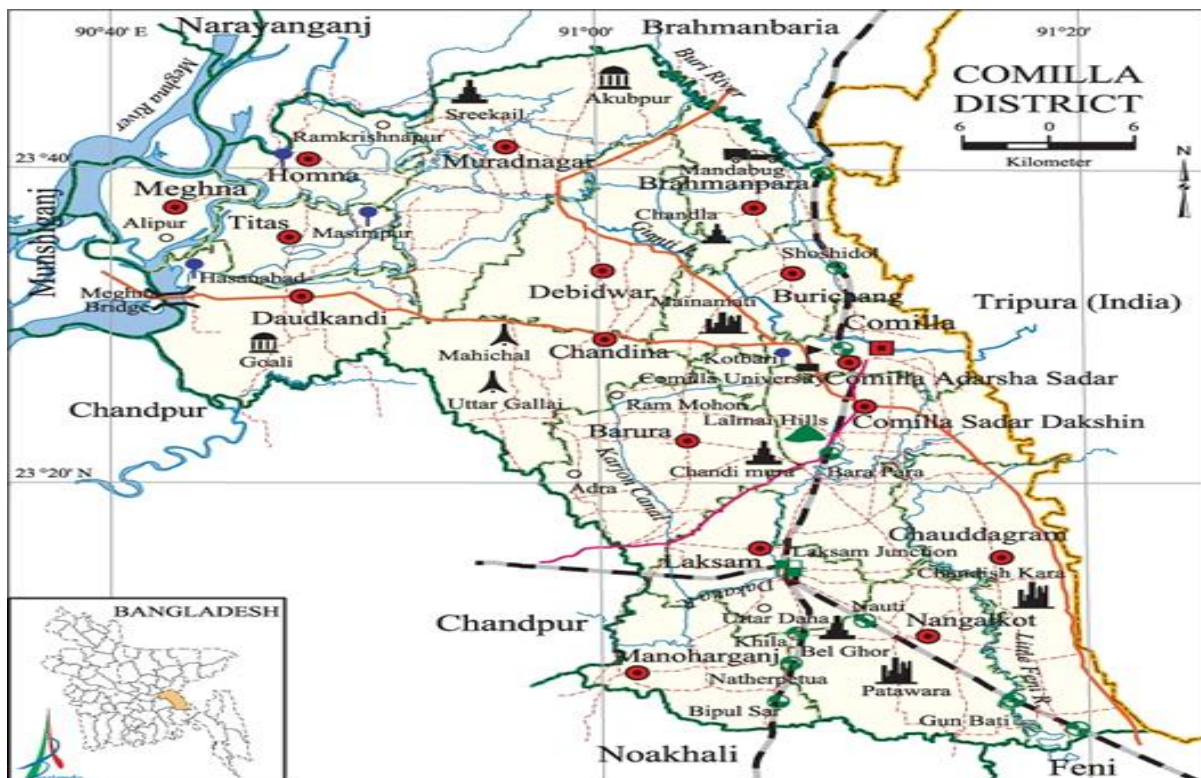
Figure1: Map of Comilla district

In Comilla district the recycling is done by individual recycling industries. It was observed that recycling industries are situated in every upazila of the district. A questionnaire survey has done to know about the present recycling system of plastic waste. Total number of recycling industries in Comilla district has been determined. In figure-1 the location of Cumilla district upzila are shown.