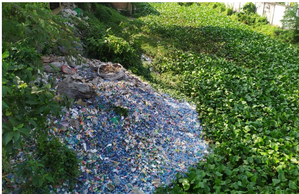
Figure-4: Disposal practice of waste label.

As Cumilla district has 17 Nos upazila. Total 32 Nos plastic recycling industries has been found in this study. In table-1, total plastic waste, recycled plastic waste and waste level has been shown.