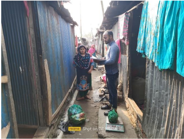
(a) Waste collection at inside of the Senpara slum area