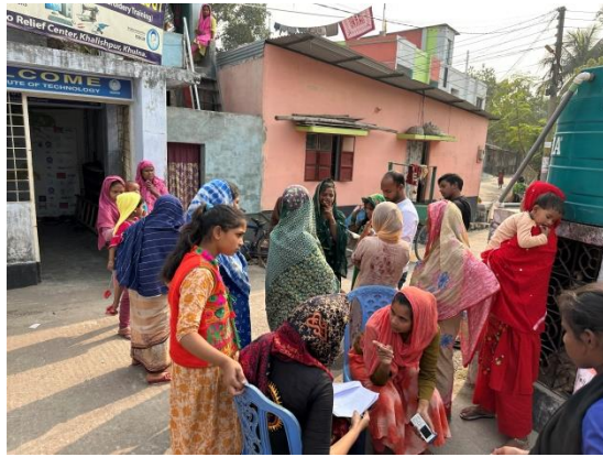
(a) Questioner survey at 12 no. word, Khalishpur in KCC