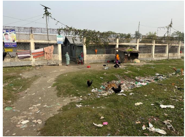
(b) Waste dumping area entry side of