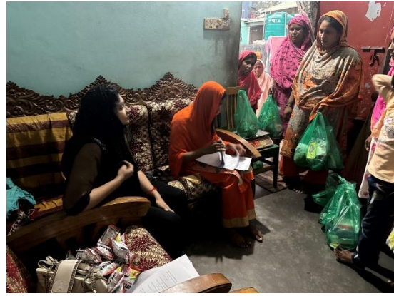
(b) Waste collection at in-side of 12 no. word, Khalishpur in KCC.